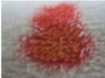
pH 4 : Too low

Add a few drops of Universal pH indicator on the fabric to be tested, wait 10 seconds and compare with the color card supplied.